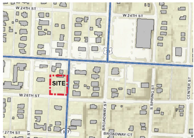
Figure 3. Master Street Plan

The primary function of a Principal Arterials is to serve through traffic and to connect major traffic generators or activity centers within an urbanized area. Lower design standards are required for Principal Arterials compared to